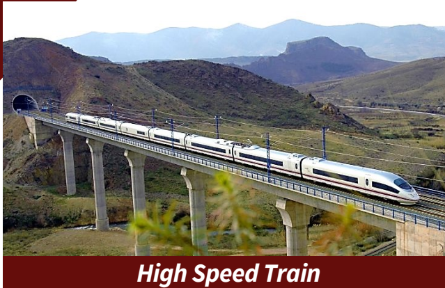
High Speed Train