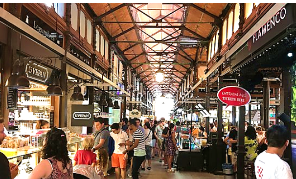
San Miguel Market

After a leisurely breakfast at the hotel, a picture-perfect day in Madrid awaits as your guide and driver escort you on a full city tour. During this private, 4-hour tour, you will see all the essential parts of Madrid, while also incorporating a short walk through the city center to see some of the most notable architectural landmarks considered to be the "best of Madrid." Learn about the history of the Spanish capital , discover the Plaza Mayor , Puerta del Sol , the Cathedral of La Almudena , the Royal Palace (all exterior visits), and the San Miguel Market . Your host will also help you find hidden gems and plazas around the city, all alive with history, legends and local culture.