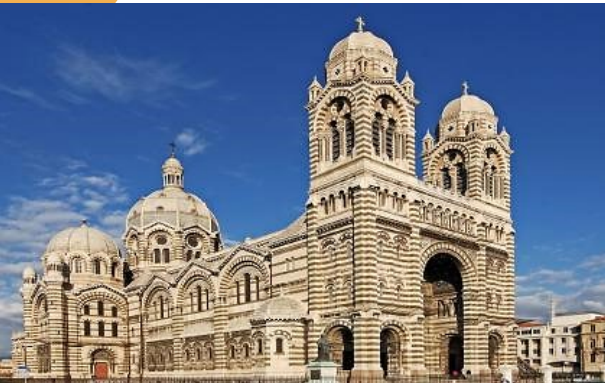
Cathedral of La Almudena