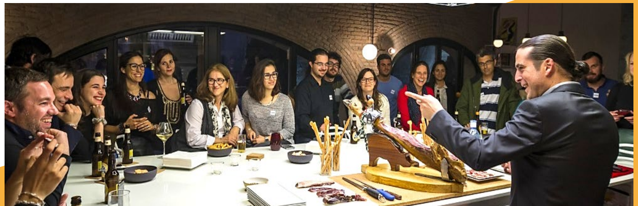
Catalan Chef's Table