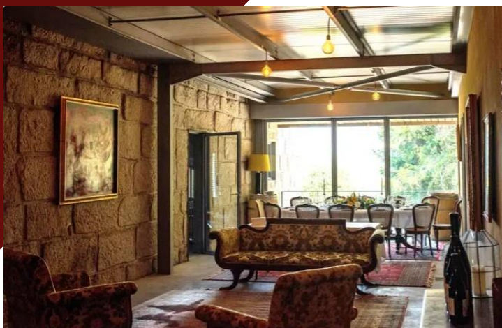
Julia Kemper Estate