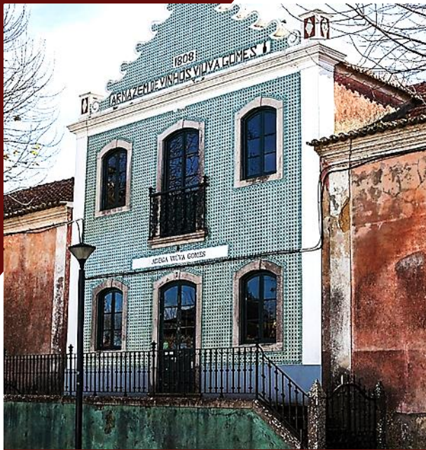
Adegas Viúva Gomes