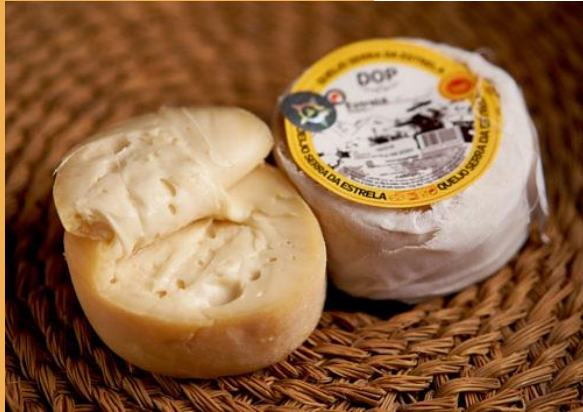
Serra da Estrela Cheese