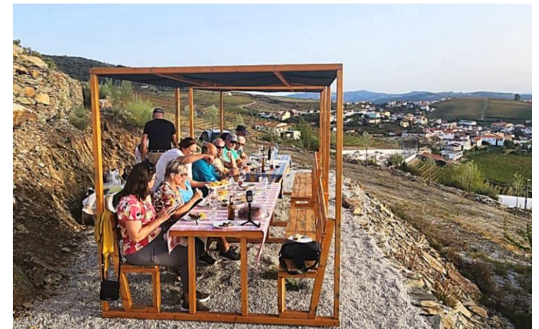
Outdoor Portuguese Barbecue