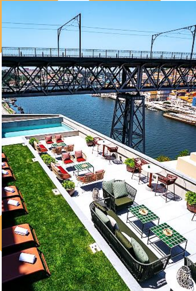
Vincci Ponte de Ferro patio

First on the agenda after breakfast, check out of the hotel and meet Ryan and your driver in the hotel lobby and leave toward the Vinho Verde Wine Region . You will be guided on a tasting journey with a visit to Aphros Winery , a 17 th century family estate in the Lima Valley. It spreads over nearly 50 acres of land, of which six and four are chestnuts orchards. At its center stands a granite 16th century 2-story manor house complete with a chapel. The wine cellar on the first-floor dates back to the origin of the house. Learn about the artisanal pressing process and spontaneous fermentation in clay amphoras lined with beeswax. Visit the tasting room/wine bar which opens to a large patio shaded by a vine pergola and stay for lunch, paired with this very special wine.