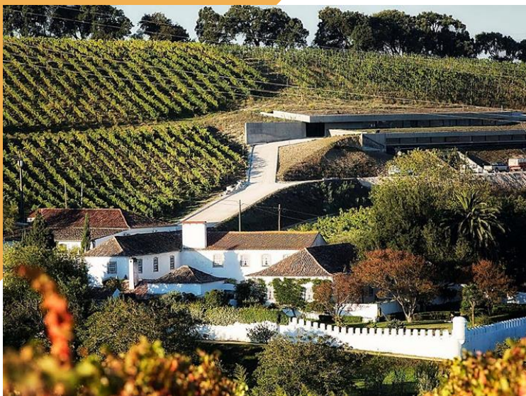
Quinta da Chocapalha