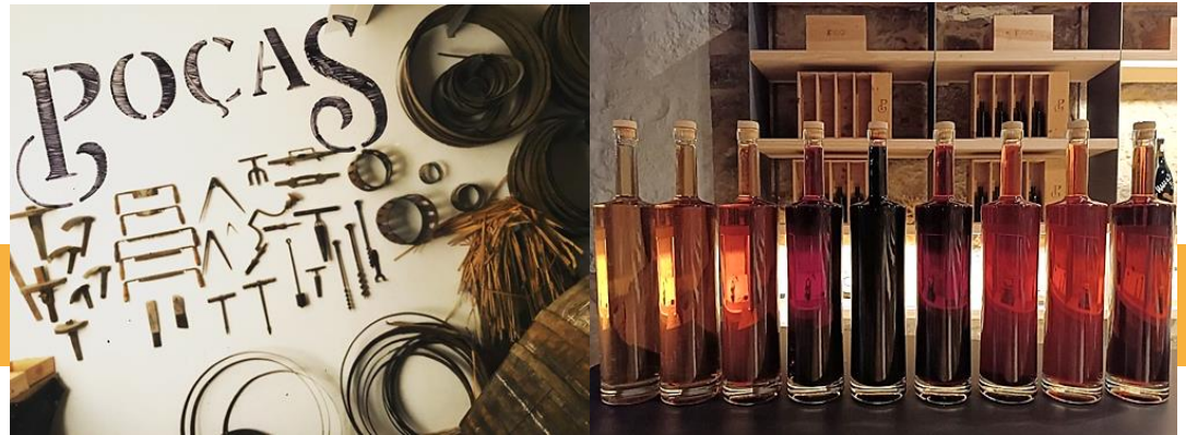
Poças Port Wine Lodge