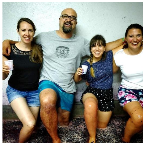
Quinta das Aranhas